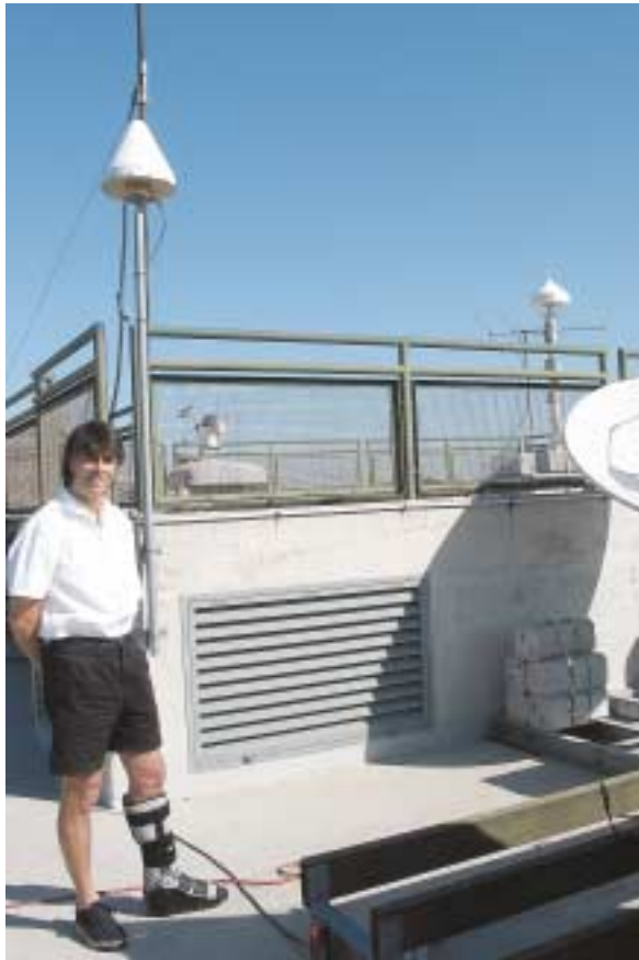
Atop one of the buildings of the Queensland University of Technology in Brisbane, an array of antennas awaits the first signals from Europe's second-generation Galileo satellites.